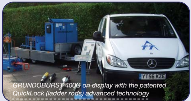
GRUNDOBURST 400G on display with the patented QuickLock (ladder rods) advanced technology