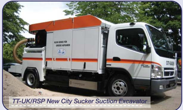
TT-UK/RSP New City Sucker Suction Excavator