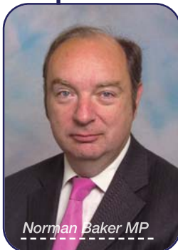
Norman Baker MP

For more information visit www.ukstt.org.uk